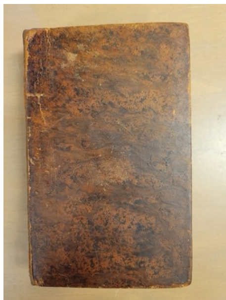
Book of Mormon Census